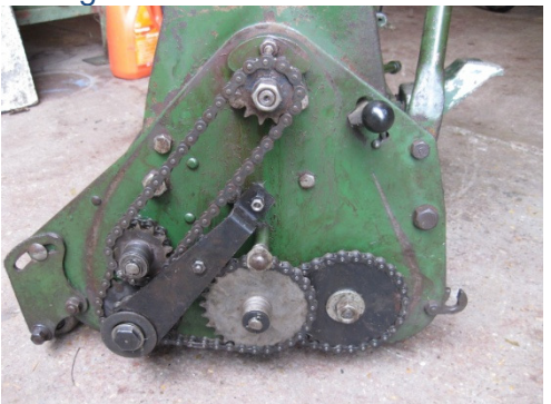
The Webb 24 (left) and Atco Royale (right) chain mechanisms are strong and well made but need to be adjusted regularly and/or replaced when they reach a certain level of wear

The wooden front rollers (fitted to the Webb 24) and the metal front roller (on the Royale) wear due to age; albeit in different ways. This gives difficulties manoeuvring the mowers We fit brand new wooden rollers (turned from high quality Ash) to our Webb 24's and change the bearings fitted to the Royale's metal front roller