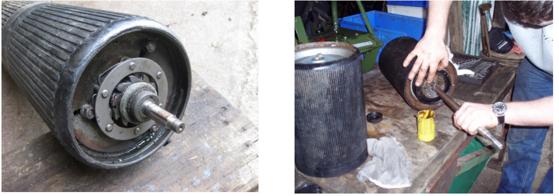
The Atco Royale Spring/ratchet differential and the Webb 24 differential being lubricated

The differential, which allows the two rear-roller sections to operate independently (essential for good manoeuvrability) wears and eventually fails, making the mower unusable The rear-rollers and differential assembly is completely stripped down, re-lubricating and replacing worn components. Springs in the Atco Royale's differential mechanism break, unless it is lubricated (this is a common problem with many Royales <u>before</u> we rebuild them)