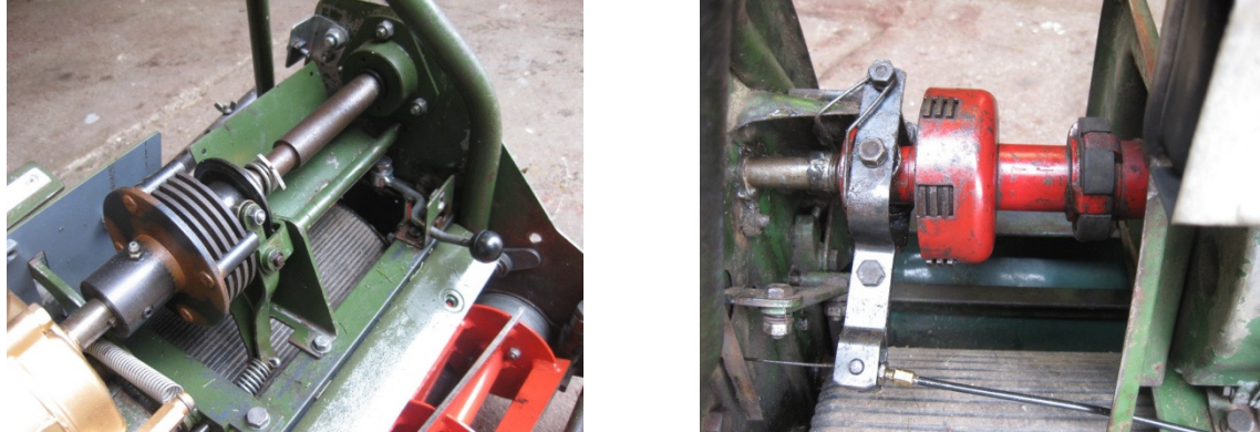
The clutches fitted to the Webb 24 and Atco Royale respectively

The clutches on both mowers wear (due to age) as do related components We thoroughly overhaul this crucial assembly, ensuring that the mowers operate correctly, fitting replacement plates, cables, bearings/bushes where appropriate